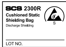
Label placed on Cushioned bag

Tolerances: Width: +/- 1/4" Length: +/- 1/4" Lip: 2" +/- 1/2" Seal width: 3/8" +/- 1/8"