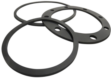
Die Cut Seals & Tapes