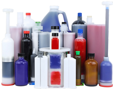
Engineered Specialty Adhesives