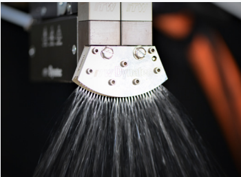
Custom Spray Dispensing