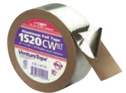
3M™ Venture Tape™ Aluminum Foil Tape 1520CW

3M Industrial Adhesives and Tapes Division 3M Center, Building 225-3S-06 St. Paul, MN 55144-1000