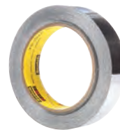
3M™ High Temperature Aluminum Foil Tape 433