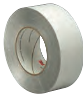
3M™ Aluminum Foil Tape 427