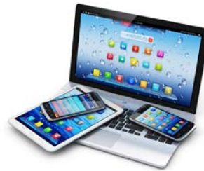
Consumer Product Displays