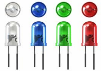
Resin Electrical Encapsulation