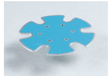
Dispensable Thermal Pads